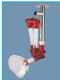
SPOT EXTRACTOR ARMS