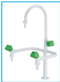
THREE WAY WATER TAP

A picture with their names could be of better help for your comprehension & Understanding.