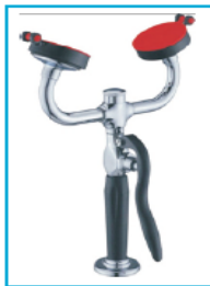
PORTABLE EYE WASH