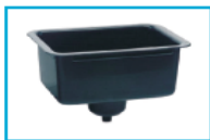
P. P. MID SINK