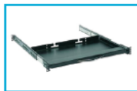
KEY BOARD DRAWER