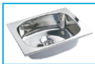
S. S. SINK