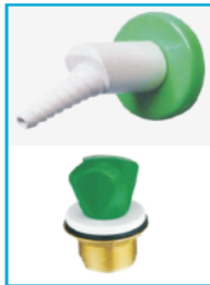
PANEL MOUNTED VALVES